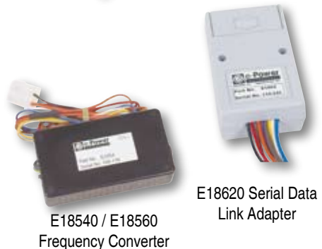
E18540 / E18560 Frequency Converter