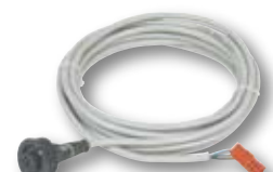
E16270 2159 rpm Harness