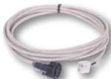
E16220 2155 Speed Harness