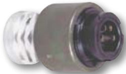
E08140 2159 Sending Unit