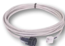
E16260 2155 rpm Harness