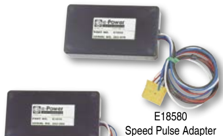
E18580 Speed Pulse Adapter