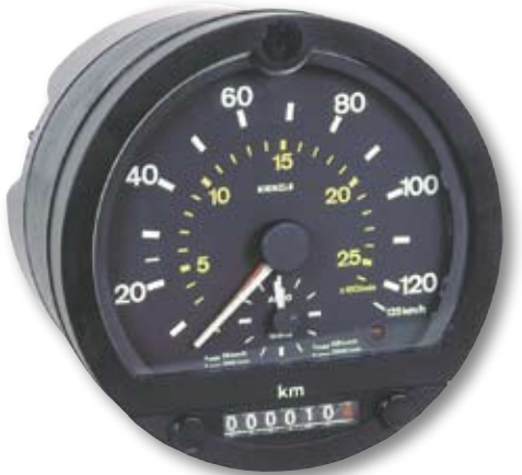
Speed and rpm