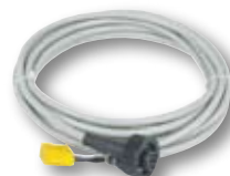
E16230 2159 Speed Harness